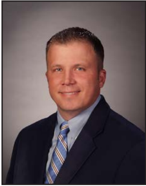
By: Todd Mouw, President of Roush Clean Tech

Let's ring in the new decade with some great news: alternative fuel tax credits are back! Although propane vehicle technology makes good economic sense without subsidy, these added incentives on the fuel and infrastructure are like the proverbial icing on the cake!